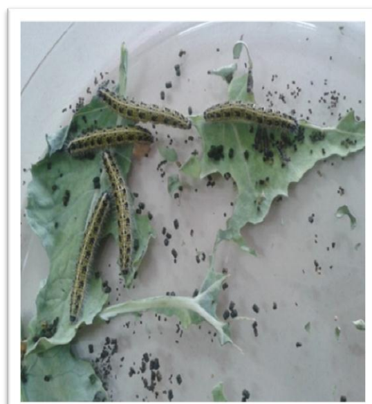
Plates II: Larvae of cabbage butterfly