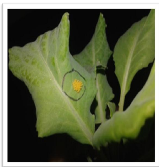
Plates I: Eggs of cabbage butterfly