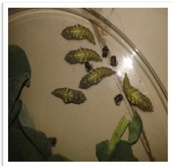
Plates III: Pupa of cabbage butterfly